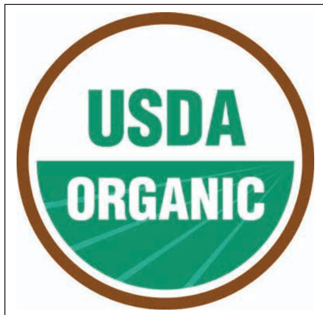
Figure 3—The USDA organic seal